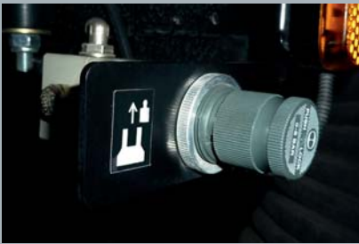
Floating suction nozzle