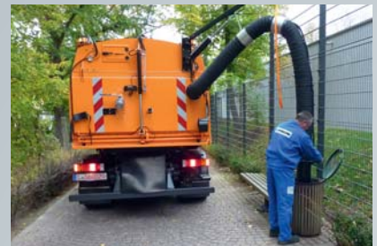
Manual suction hose at the rear