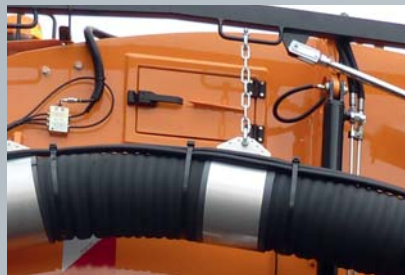
Cleaning hatch for suction channel