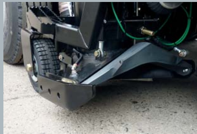
Inclined suction nozzle