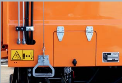
Wire rope for leaf screen