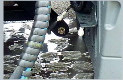
Spray jet package