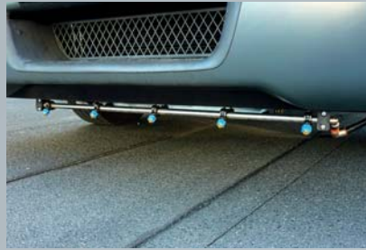
Front road-cleaning system