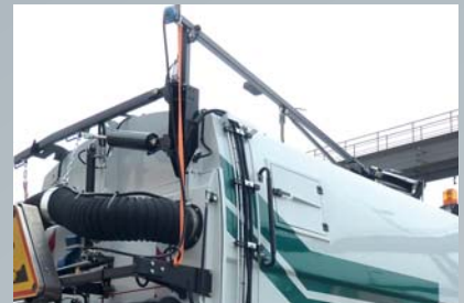
Roof arm for high-pressure lance