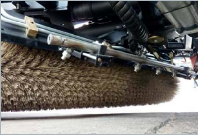
FLATJET behind the roller brush